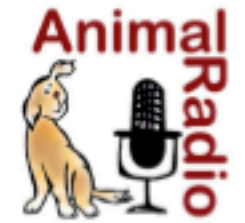
■ HH Subscribes to Satellite Radio